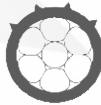
INSULATED COMPACTED NEUTRAL DR MESSENGER CONDUCTOR