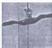
TYPICAL STRAIGHT-RUN LOCATION OF CABLE