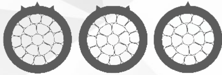
COMPACTED CROSS SECTION OF PHASES CONDUCTORS