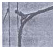
TYPICAL ANGLE LOCATION