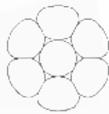
COMPACTED UN-INSULATED NEUTRAL CONDUCTOR