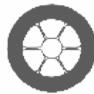
COMPACTED STREET LIGHT CONDUCTOR